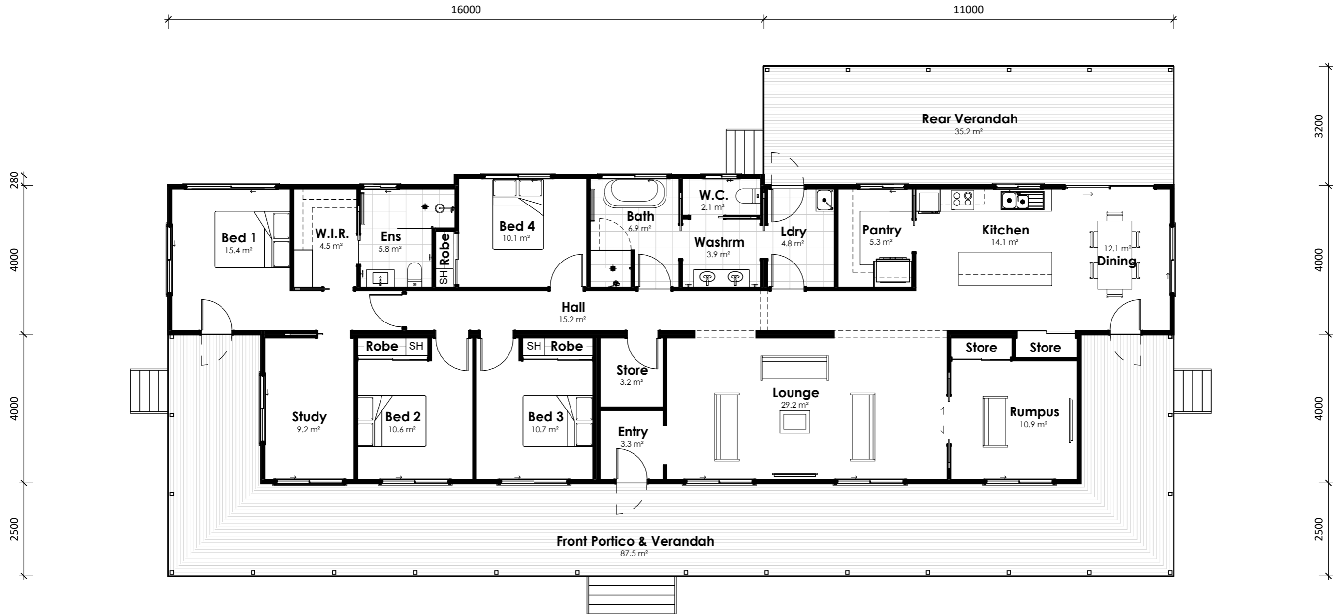
FLOOR PLAN 1:100