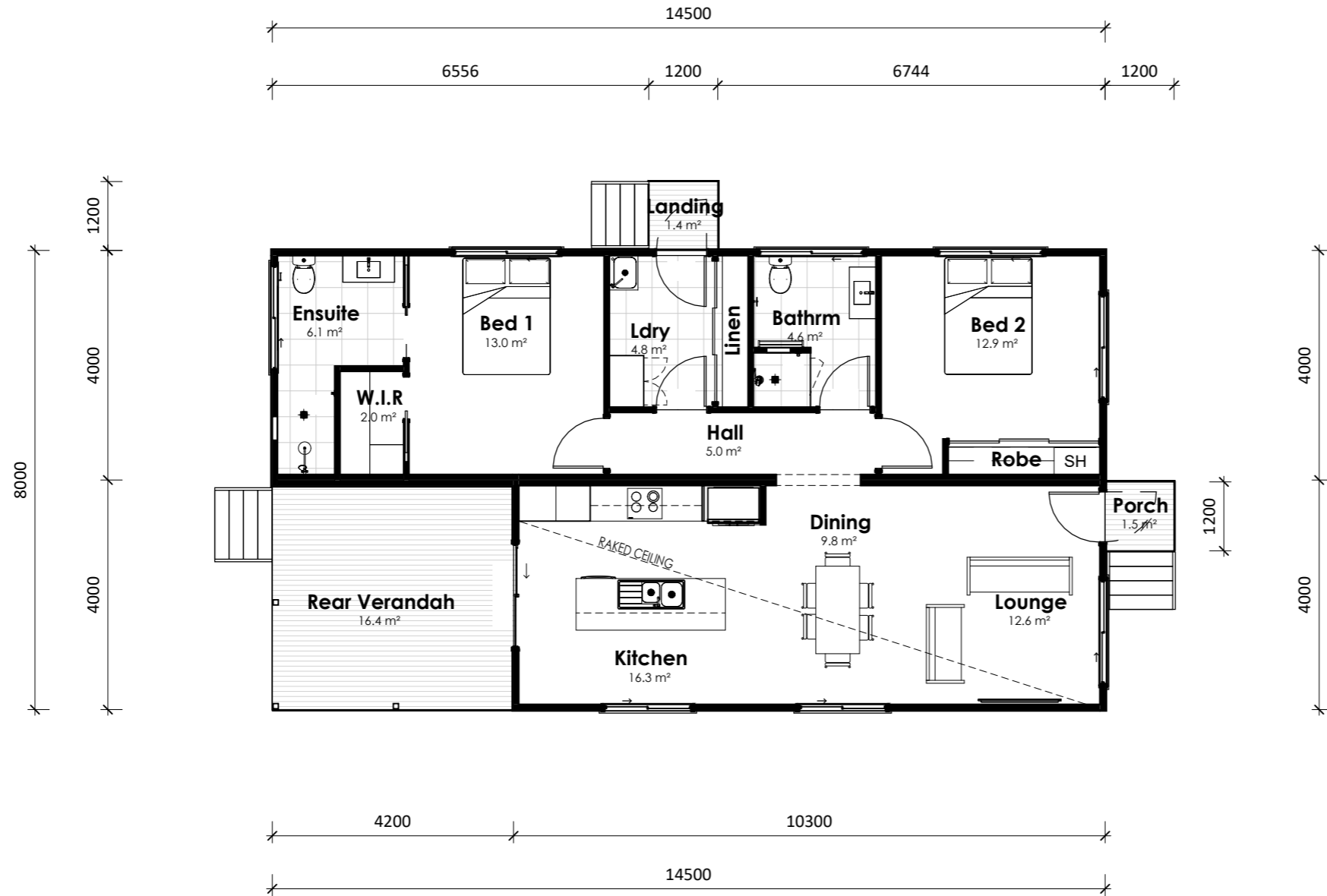
FLOOR PLAN 1 : 100