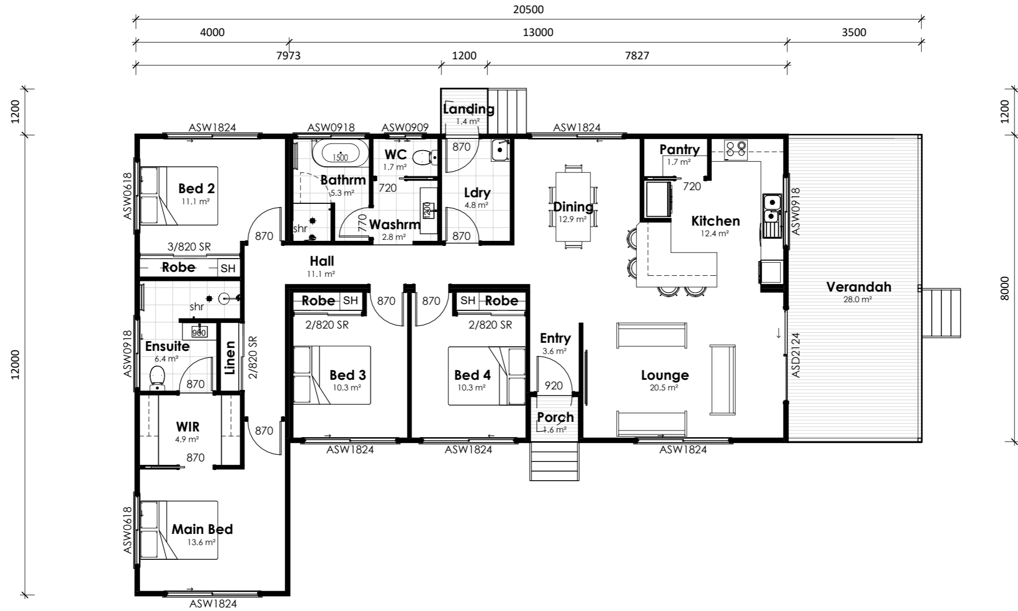
FLOOR PLAN 1:100