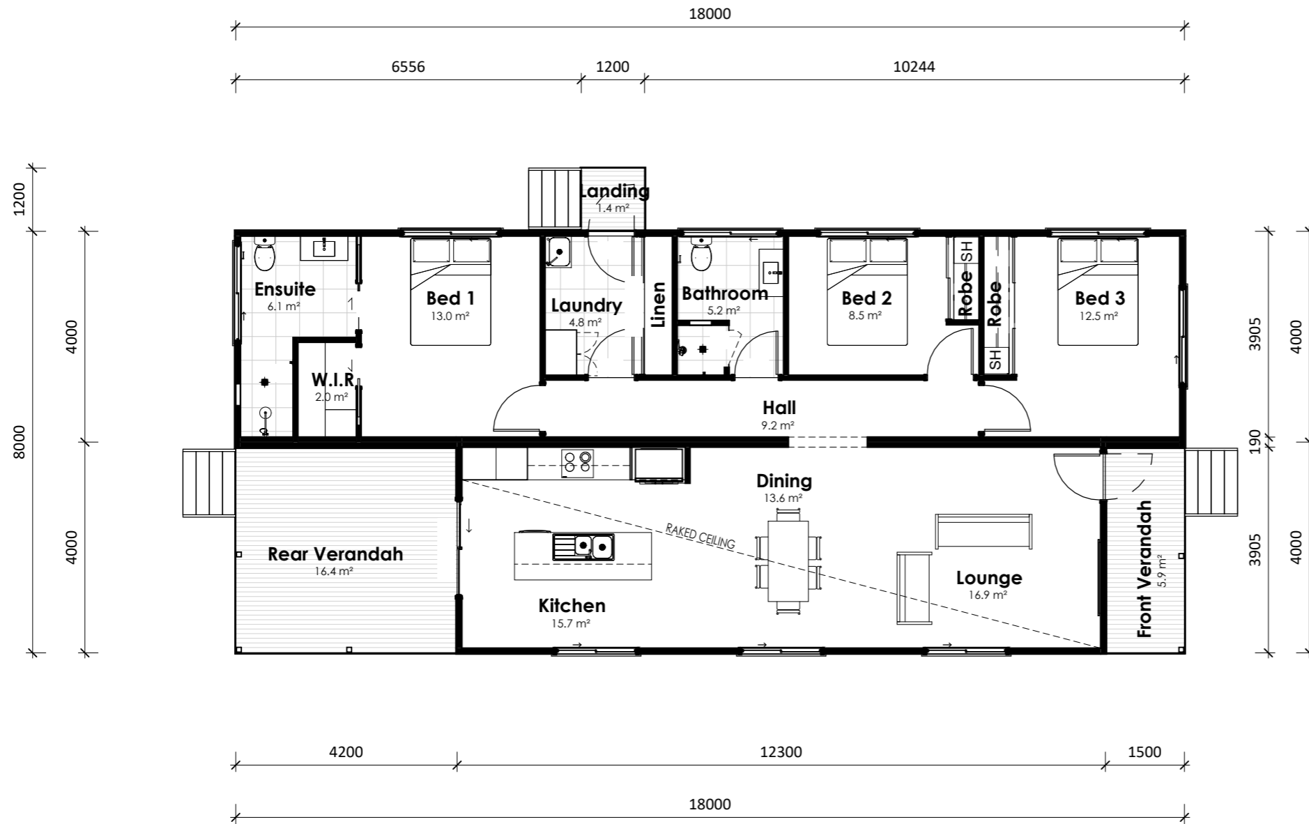
FLOOR PLAN 1 : 100